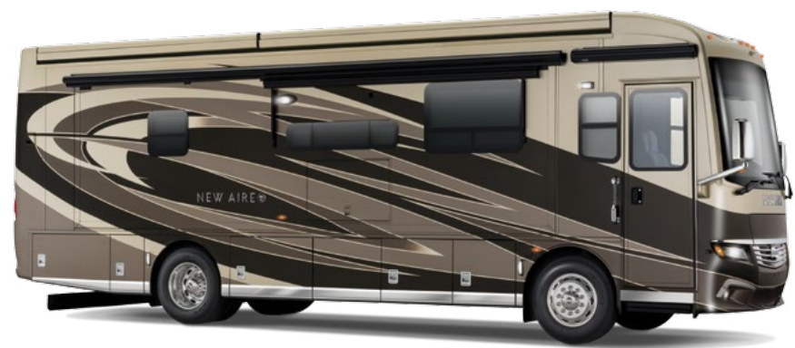
MOONBEAM EXTERIOR Awning Color: Linen Tweed