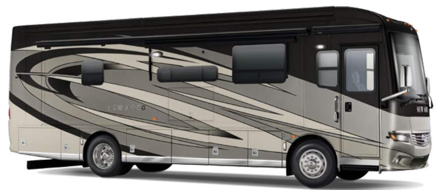
SHADOW EXTERIOR Awning Color: Charcoal Tweed