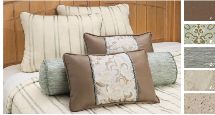
GLACIER INTERIOR a. Furniture/Fabric b. Flooring c. Counter Top