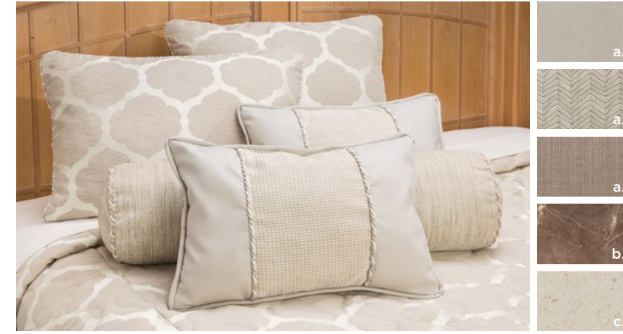
MOONBEAM INTERIOR a. Furniture/Fabric b. Flooring c. Counter Top