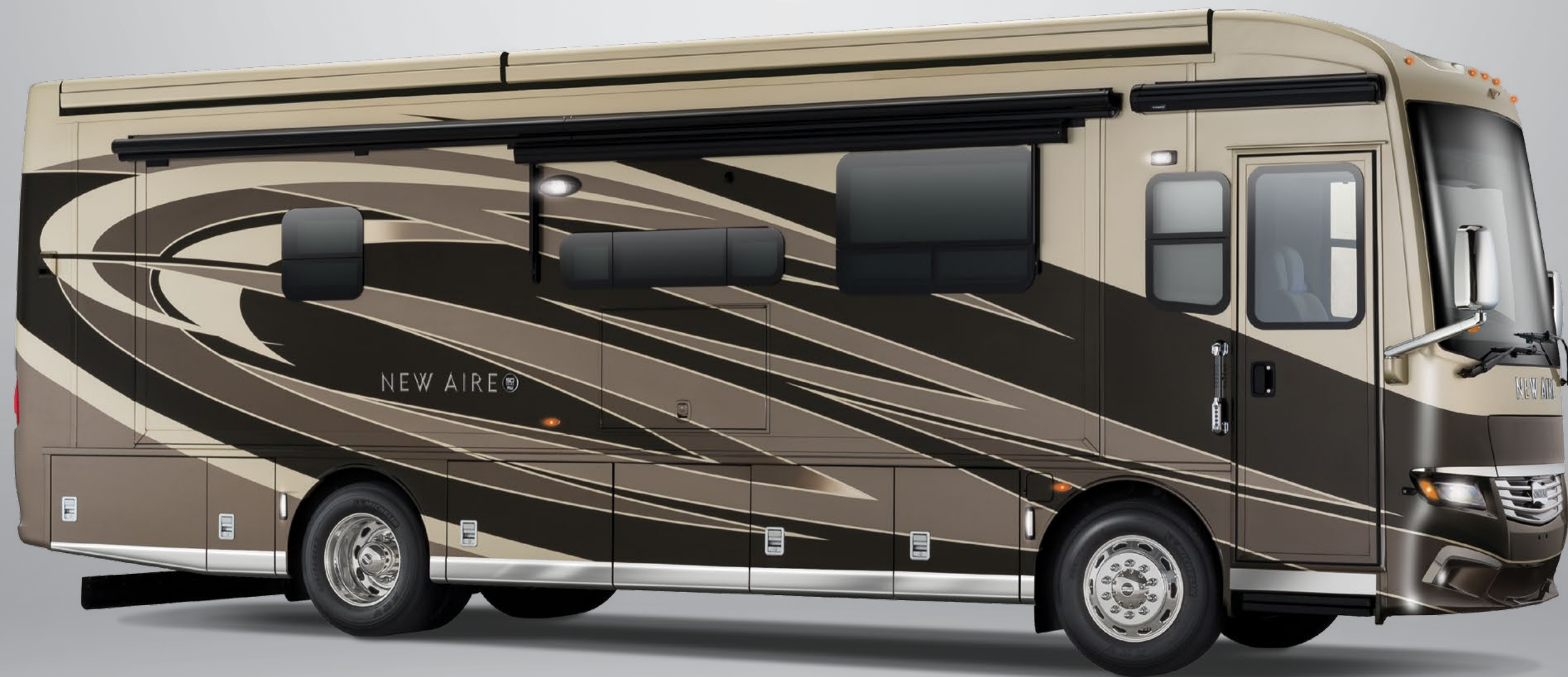
Full-paint Masterpiece™ Finish | Moonbeam Exterior | Floor Plan 3343