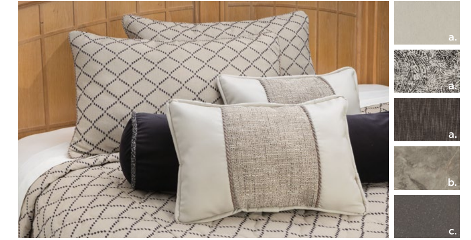
SHADOW INTERIOR a. Furniture/Fabric b. Flooring c. Counter Top